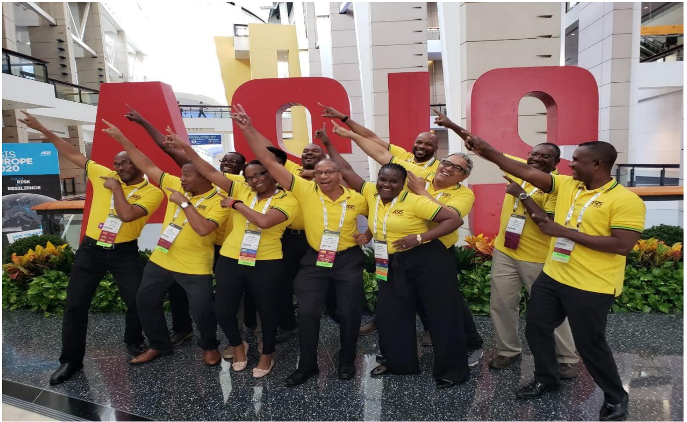
Chapter # 74 to di 'Whirl'